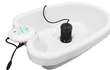
Indicator light (lighting state)